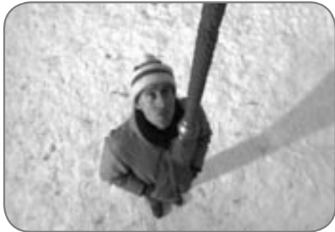
Still detail from Dangle