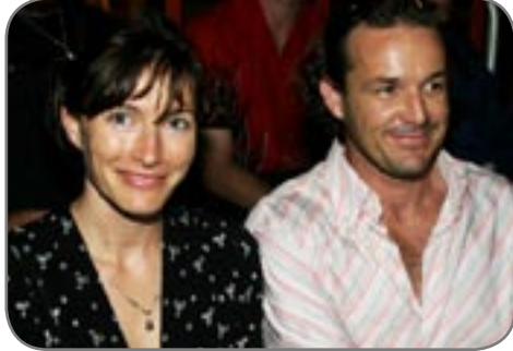
Claudia Karvan & friend