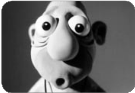
Still detail from Harvie Krumpet