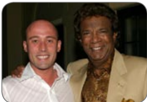
Adam Elliot & Kamahl