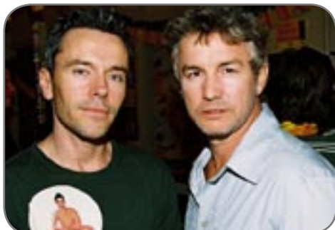
Craig Pearce & Baz Luhrmann