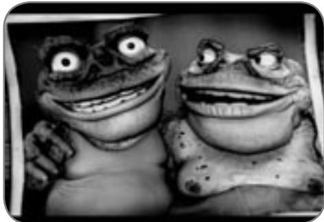
Still detail from Cane Toad