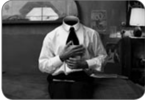
Still detail from The Man Without a Head